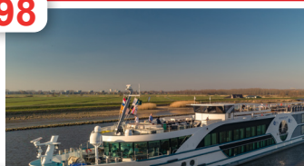
Riviera: New Ships, New Itineraries