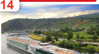
Plantours: New Ship Debuts