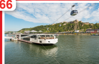
Viking: No Stopping Hagen