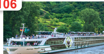
Tauck: Increased Engagement