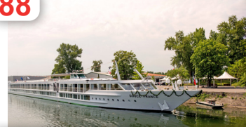
CroisiEurope: Rivers, Canals and Oceans