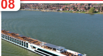
Dunav Tours: Managed Growth