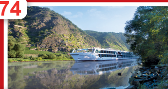
Amadeus: All In At Half Throttle