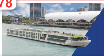
Scenic/Emerald: Agent Relationships Key