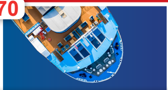
AmaWaterways: Three New Boats in 2021