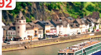
Abercombe & Kent: Wide Ranging Program