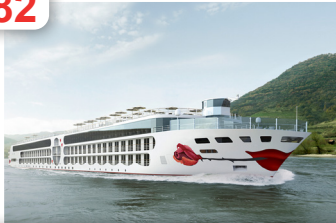
A-ROSA: Green Ships