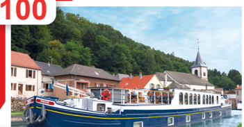
European Waterways: Luxury Barging