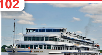
Doninturflot: Pronounced Demand