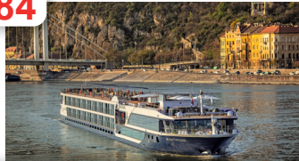
Avalon Waterways: Doing The Right Thing