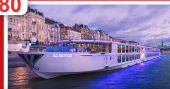
Uniworld: The Future 'Assured'