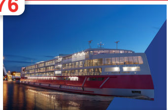
Vodohod: Pressing On