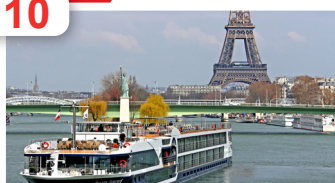
River Advice: Responding Quickly