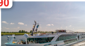
Phoenix Reisen: Relaunching Service