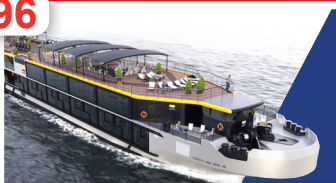
Riseday: Busy and Smiling