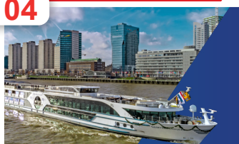
Scylla: 32-Boat Fleet