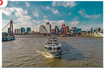
A 2021 of Promise