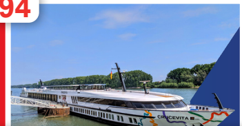
Crucemundo: Looking Younger