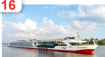
Nicko: German Positioning