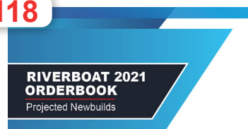
Riverboat New Ships 2021