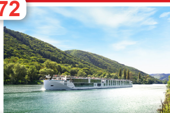
Crystal: Strong Bookings